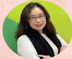
Chia-Tien Hsu Director, Department of Women's Affairs, Democratic Progressive Party (DPP), Taiwan