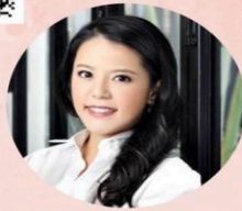
Siripa Nan Intavichein Chairperson, CALD Youth Democrat Party (DP), Thailand